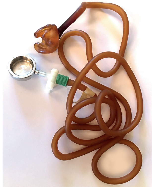
Fig. 4. — Personalized earpiece connected through IV tubing to a stethoscope, taped to the precordial area, to monitor heartbeat and respiration.

The "mains" was always switched on as the measuring cell needed to be warmed up before use. Below the on-off knob (mains), the air pressure had to be adjusted to the atmospheric pressure. During calibration, the meter (arrow) was put on the red dot on the Vol. % CO 2 ; next the 0 knob to calibrate zero value of CO 2 ; the switch had to be put subsequently on: a) operate; b) zerogas = 0; and c) calibrate = 6. Next sits a flowmeter, a control knob for exhaust speed and a printer with adjustable print speed to obtain a trend or capnogram.