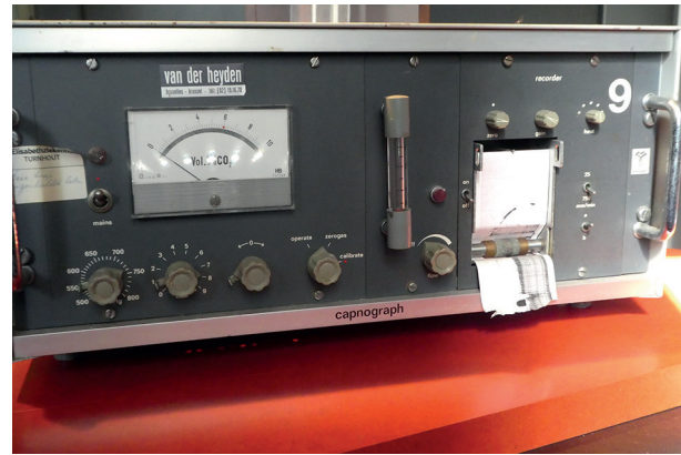
Fig. 3. — Godart Capnometer, produced in the Netherlands, distributed by Van Der Heyden in Belgium.

In these early days, electrocardiography (ECG) was not routinely used during anesthesia. To continuously monitor heartbeat and ventilation, a precordial stethoscope (Figure 4) was applied, consisting of a personalized earpiece that was connected via IV tubing to a stethoscope taped to